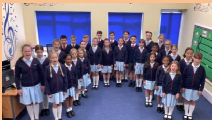
Russell House Chamber Choir sing in the 11 yrs and under

Classes were available for solo, duet and group items where Covid rules could be adhered to. The number of entries rose 30% compared with 2020, with over 200 young people and adults participating in total, from the age of 6 upwards. Entrants generally captured their videos on smart phones at home or at school, and once again performances were of a high standard, with a noticeable improvement in confidence in front of camera. This year, for a limited period following adjudication, entrants and their teachers have the possibility to view other entries in their class and, for some classes, a video from the adjudicator discussing the performances is also available.